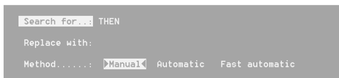
Figure 1: The top section of the Search Options box.

is the neatest part of the macro. F7 starts another search.