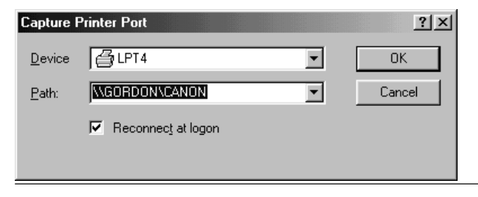
Figure 1. Telling Windows to capture output directed to LPT4 and redirect it to the network printer at \Gordon\Canon.