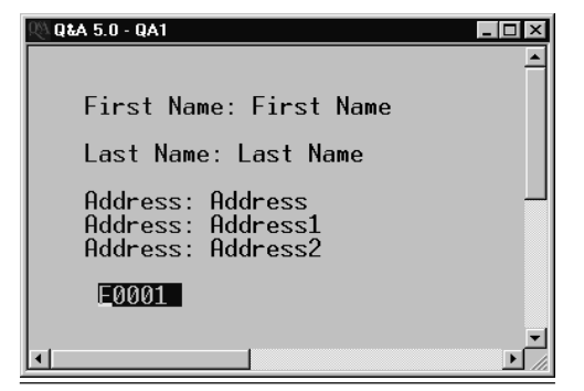
Figure 1. After the initial Address field, Q&A assigns names to additional Address fields with a sequential number. A field without a label will be named by Q&A starting with F0001.

Save the design, return to the Field Names Spec, and you'll see what's shown in Figure 1.